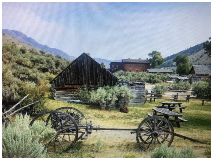
View of Bannack, MT

Visit our Facebook page: https://www.facebook.com/NSFWA